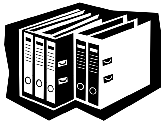
Over 4 million pages are now available

Searching: Enter basic and advanced searches of keywords, topics, titles, authors and dates by clicking on "Search the Journals" and typing information about your search requirements. Perform cross-disciplinary searches by selecting several journals in one search.