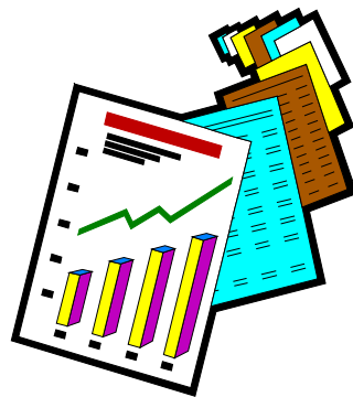
Gartner information can reshape an enterprise and improve the bottom line.

Gartner Advisory Intra Web: a single source access to all levels of Gartner research. Gartner's team of over 1200 analysts covering aspects of IT provides incomparable research capabilities. This includes strategic evaluations of technologies, IT vendor evaluation, market insight, industry trends/directions, vendor perspectives, and tactical IT vendor analysis. Access to Gartner helps students and faculty to keep pace with the speed of IT and the ever-changing scope of the industry, from both an