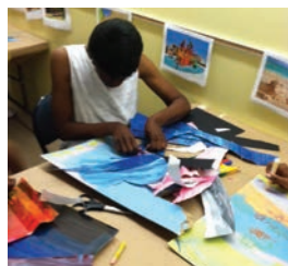
SpArc Artist at Work, June 2014.