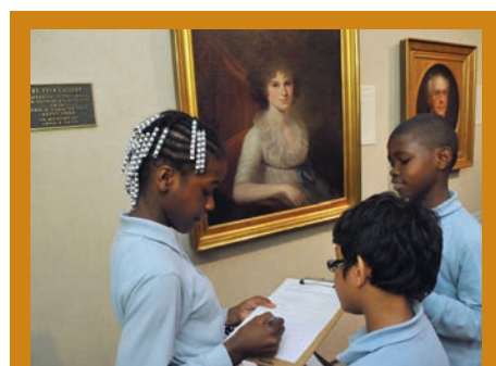
Fourth grade students participating in a History Hunters pilot lesson, May 2014.

Implementation of the expanded program with five historic sites begins September 2014 and is organized chronologically. The lessons at La Salle will take place from December through early March. During a two-hour visit, students will receive a guided tour of the Belfield property; study portraits by artists of the Peale family in the