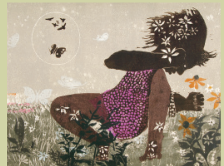
WALTER WILLIAMS Girl with Butterflies, 1964 Woodcut in five colors

Study the museum's collections in greater depth by arranging two, three, or four visits to the museum throughout the school year. The Assistant Curator of Education will work with you to determine the visiting program that complements your curriculum.