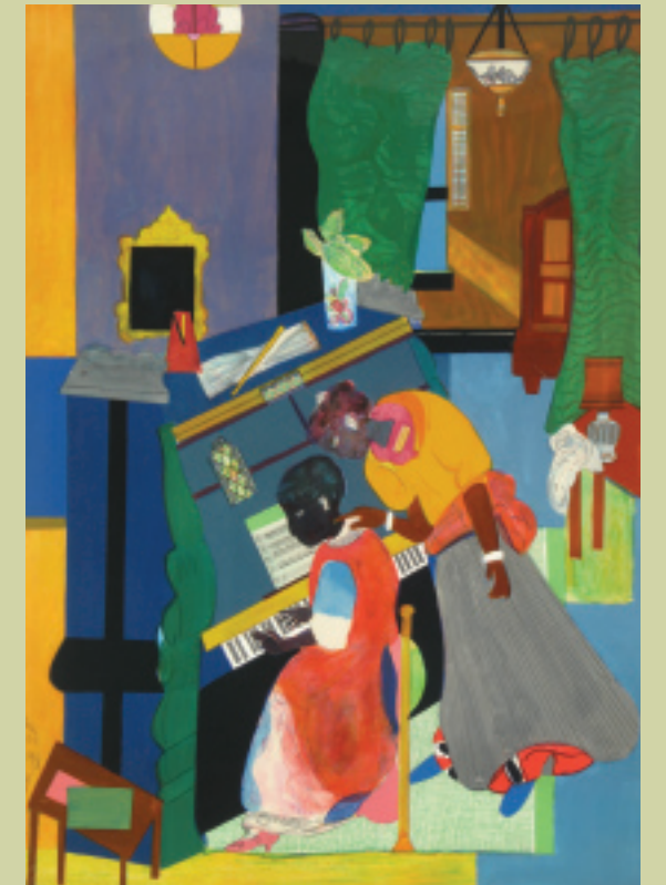
ROMARE BEARDEN Louisiana Serenade Off-set color lithograph

Explore the museum's 20th-century galleries and discuss the range of styles in modern and contemporary art.