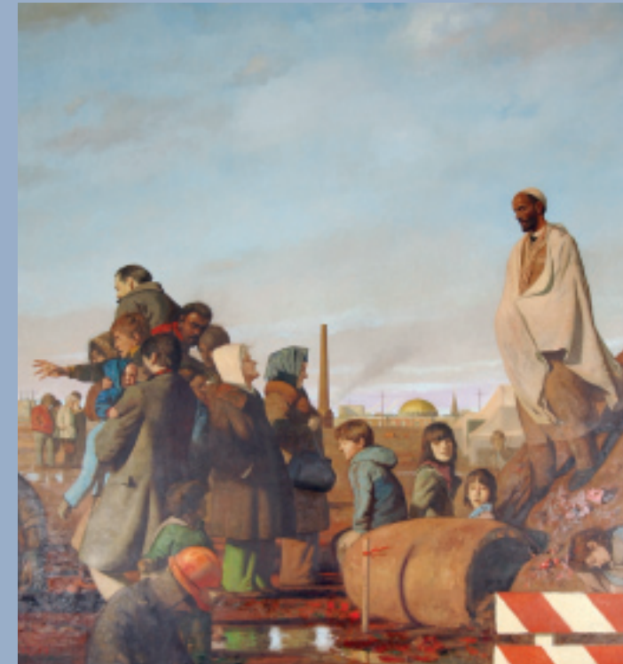
BO BARTLETT Jesus at the Festival of Shelters Oil on canvas Gift of St. Luke's Episcopal Church

Due to the size of our museum and to ensure the quality of your museum experience, we can only accommodate up to 30 students per visit. If your group is larger, please contact the museum for further information.