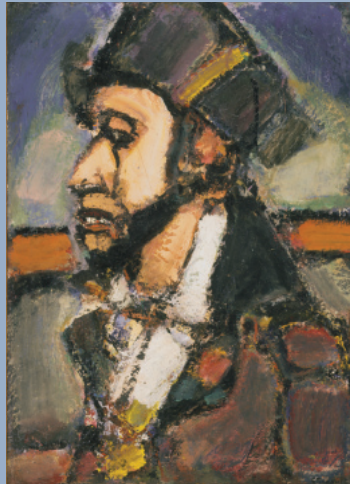
GEORGES ROUAULT Le dernier romantique, 1937 Oil on canvas

The La Salle University Art Museum's educational programming for middle and high school students is made possible through generous support from the Connelly Foundation. Further educational and community outreach program support comes from The Brother Daniel Burke Endowment Fund.