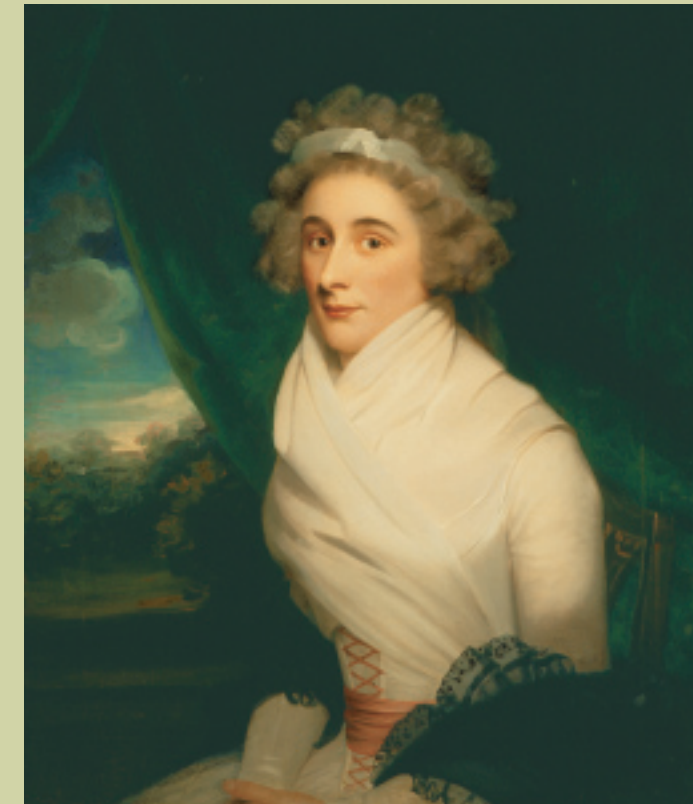
RICHARD COSWAY, R.A. Lady Elizabeth Foster, Later Duchess of Devonshire Oil on canvas

Compare and contrast artists' interpretations of biblical figures and stories from the Renaissance to the 20th century.