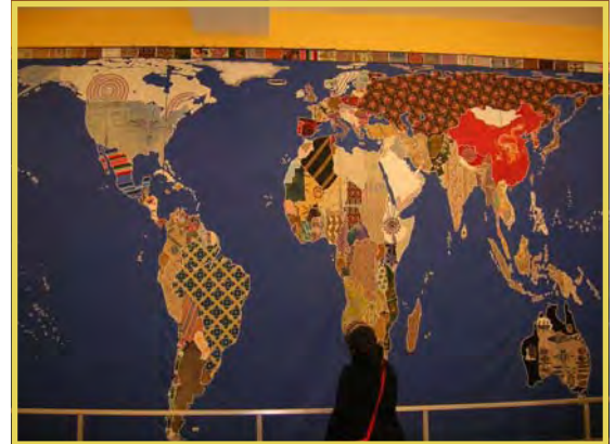
This tapestry displays a snippet of the cultures of the world. The multicultural and international center has many resources about these countries and you can also learn about travel study and study abroad programs.

Please direct questions, comments or suggestions to deleonc2@lasalle.edu and CollinsS@lasalle.edu . We look forward to seeing you next year in 2008!