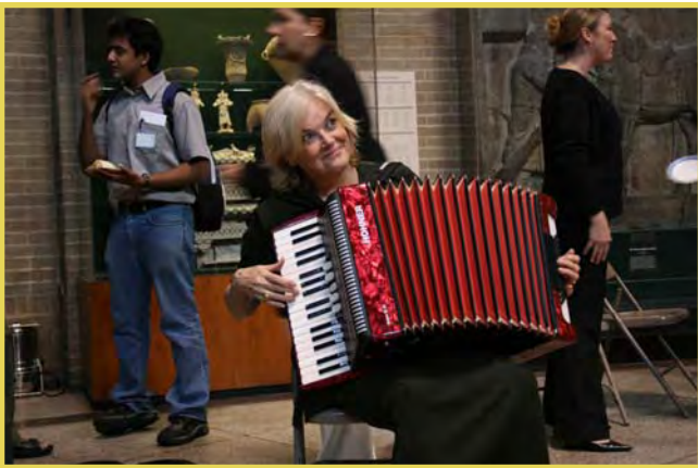
Left: A performer plays the accordion at the reception. Lower Left: Students pose outside of the reception building. Below: This figure shows the cultural demographics of the new international students at La Salle.