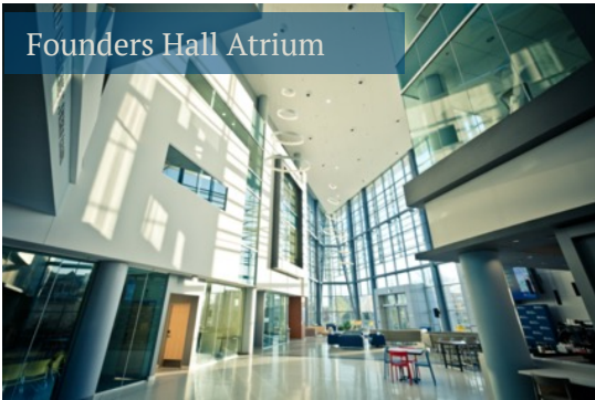
Founders Hall Atrium

Event Venues at La Salle University are available year-round and may be rented for a half day of up to 4 hours or a full day of up to 9 hours.